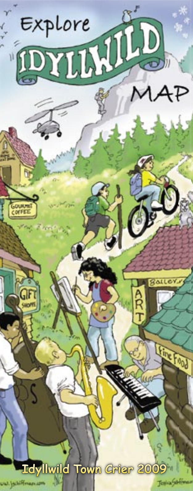
Idyllwild Town Crier 2009